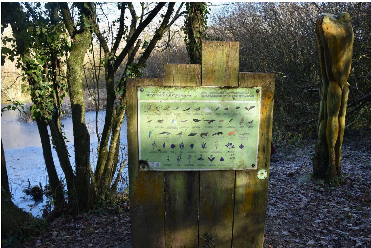
Bridgend Local Nature Reserve

For highway structures, the current basis for prioritisation is one of reactive safety repairs, where the asset is risk assessed using a standardised matrix. This risk assessment is then considered against the individual assets Bridge Condition Indices (BCI) rating. This allows the prioritisation of schemes and allocation of the available budget to ensure the best value is achieved. A similar approach is applied to carriageway and footway schemes, where combinations of technical survey, site inspections and reports from members of the public determine the basis for the prioritisation of works.