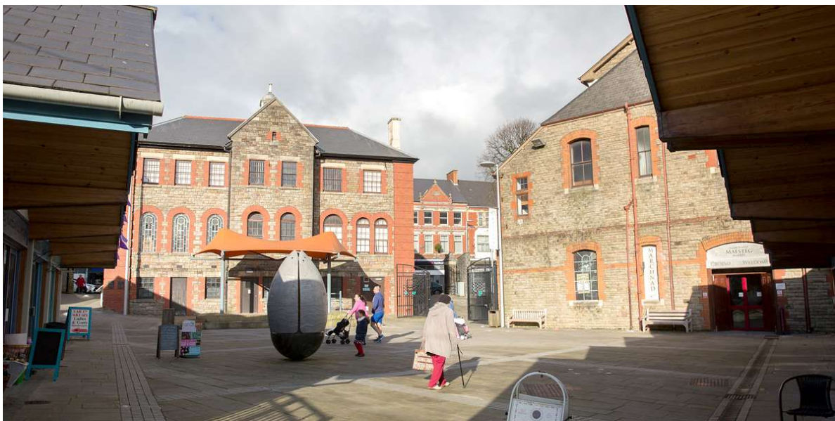
Maesteg Town Centre

All the Council's capital projects have project teams from all the professional disciplines from across the Council and when required external professional advice is also taken. Project management tools are used and there is a strong project management ethos within the Council. Throughout the Council is a good mix of professional qualified staff and staff with both commercial and local authority experience. There is a Corporate Landlord team consisting of skilled and professional staff covering design and management, estates and valuation, statutory compliance, strategic asset management planning, facilities management, management and commissioning of repairs and maintenance and energy management to introduce new energy efficiency measures such as upgraded heating, lighting, insulation and investigating new technological solutions that will enable staff to be fully agile and provide a better service, while an online portal is being developed that will provide information, process customer requests and enable staff to log jobs and track progress. The Regeneration Team within the Communities Directorate has been successful in applying for monies from various sources such as Welsh Government, Heritage Lottery and European funding.