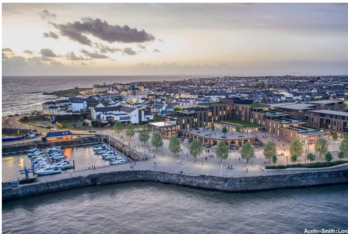
Porthcawl Regeneration Artist Impression

As can be seen from the above table, the anticipated receipts from asset sales are substantially committed in the capital programme over the period to 31 March 2026.