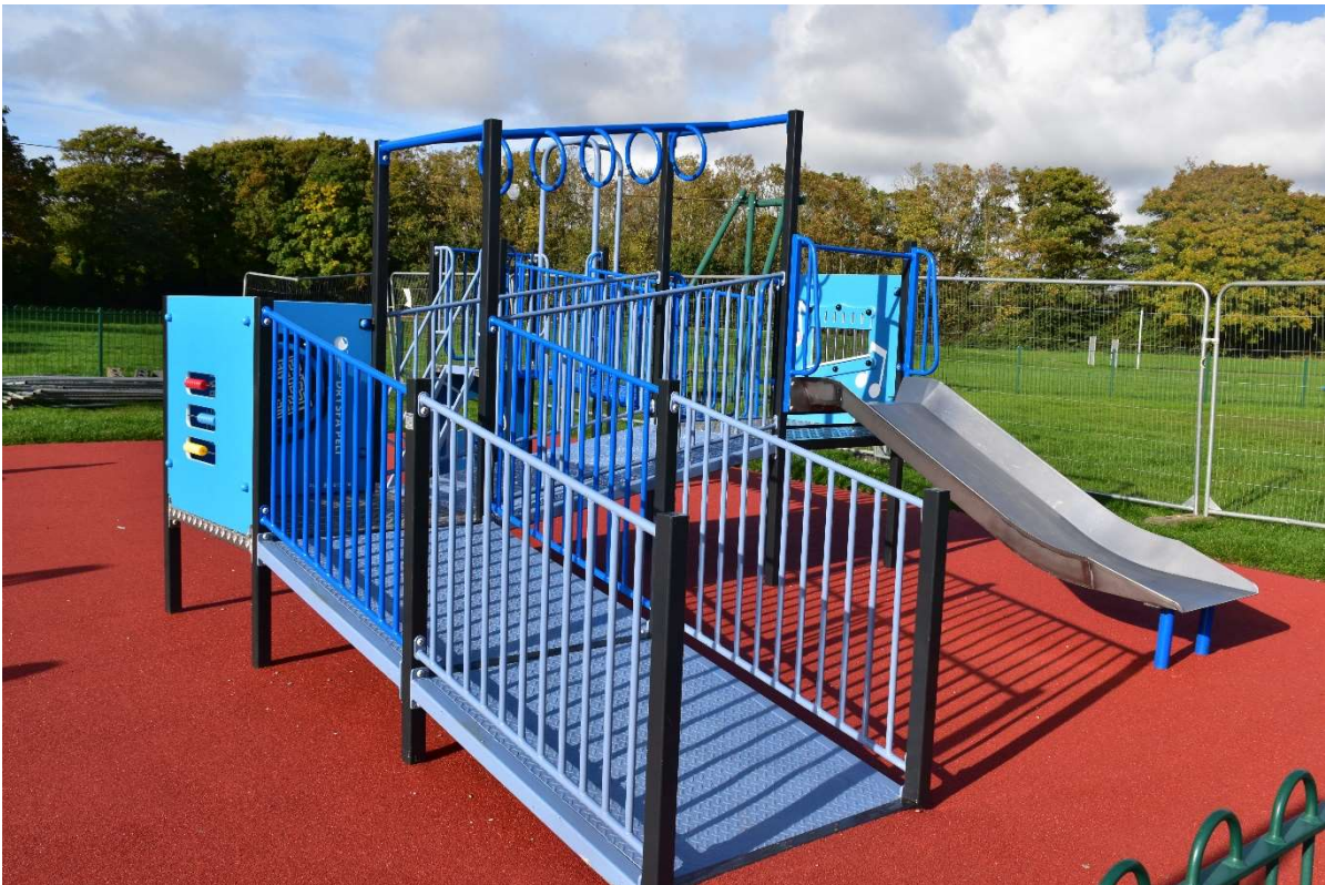
Heol y Goedwig Park Porthcawl