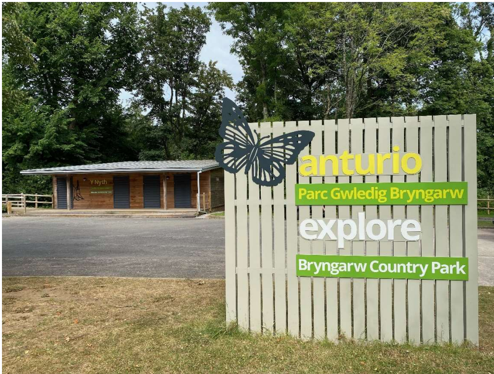
Bryngarw Country Park

The Council is able to use revenue funding and reserves for capital schemes. However, as a result of competing revenue budget pressures and the continued reduction in government funding for revenue expenditure, the Council's policy is generally not to budget to use revenue or reserves to directly fund capital projects, unless funding has already been set aside.